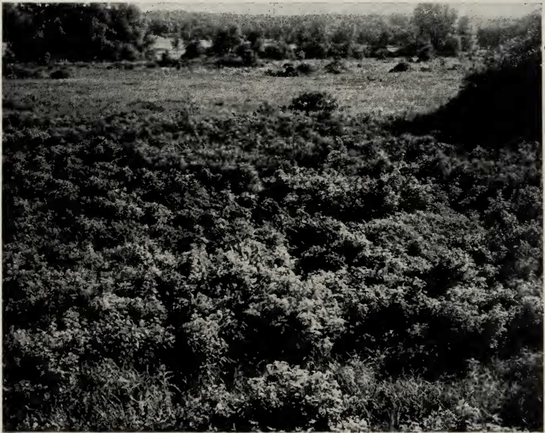
FIG. 2. View of the study area looking south. The highest breeding density occurred in these loose clumps of elderberry.

Authors disagree about territorialism of Goldfinches. Walkinshaw (1938) and Nice (1939) found no evidence of conflict between pairs and believed Goldfinches showed a definite sociability in nesting. Drum (1939), on the other hand, found definite territories that were actively defended against all males trying to settle within the territory.